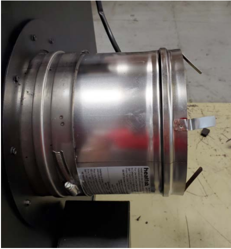
HEAT FAB VENT CONNECTOR OFF THE BACK OF THE BOILER