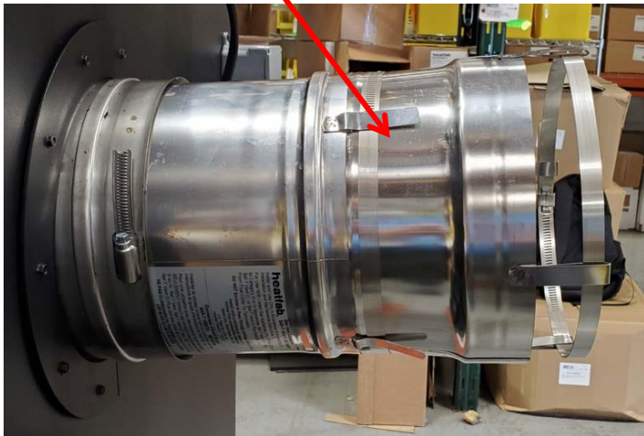
CONNECTOR TABS GO UNDERNEATH THE CLAMP PIPING INSIDE ADAPTER AND CLAMP IS TIGHTENED