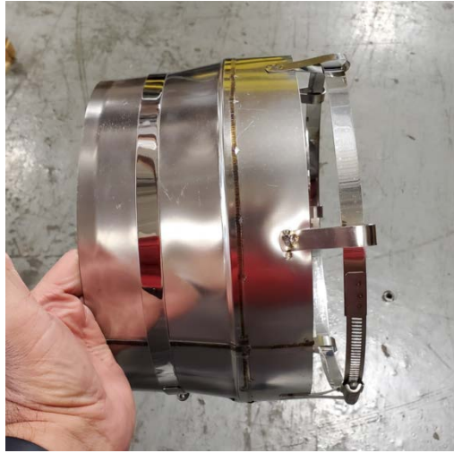
HEAT FAB VENT ADAPTER (FITS SNUG INSIDE CONNECTOR)